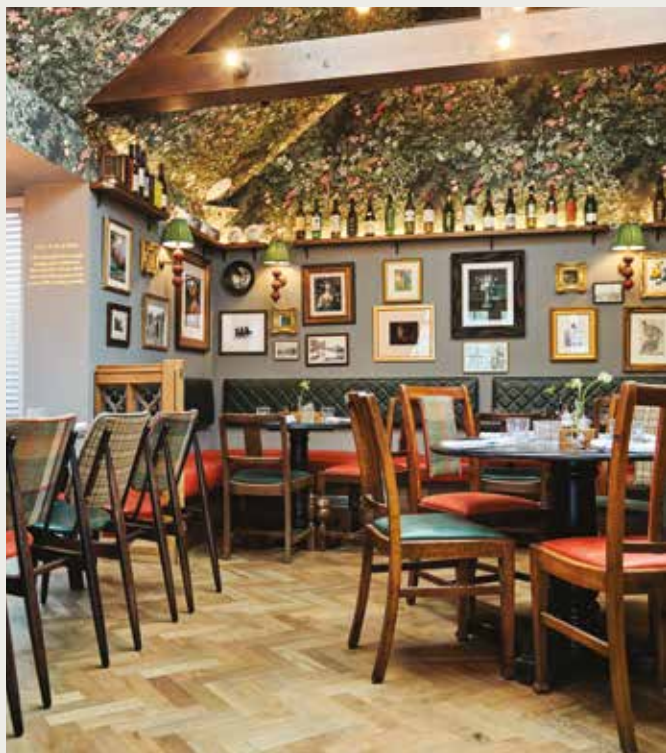
TOP LEFT: THE CABINET ROOM TOP RIGHT: THE YURT BOTTOM LEFT: GARDEN ROOM BOTTOM RIGHT: THE PIG SHED